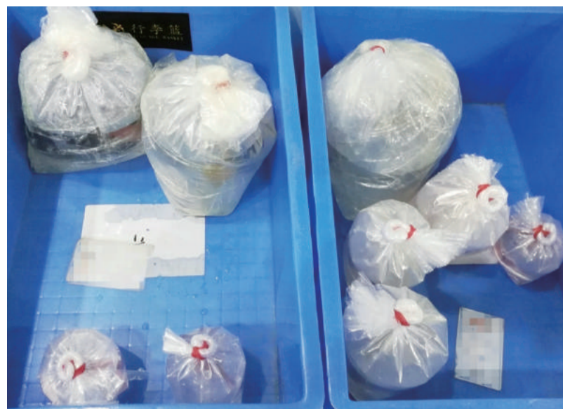
This undated handout photo provided by the Zhuhai's Gongbei Customs yesterday shows some of the plastic bags containing the smuggled fish.