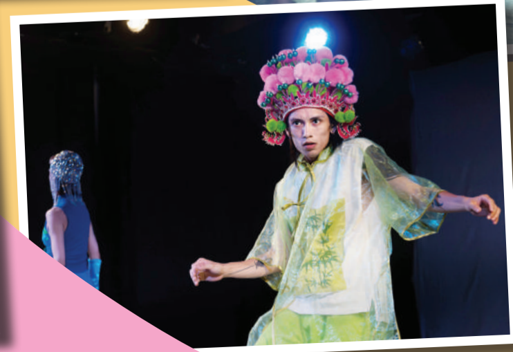
"The Uncanny" dance performance held at T Theatre in Nape on Saturday.