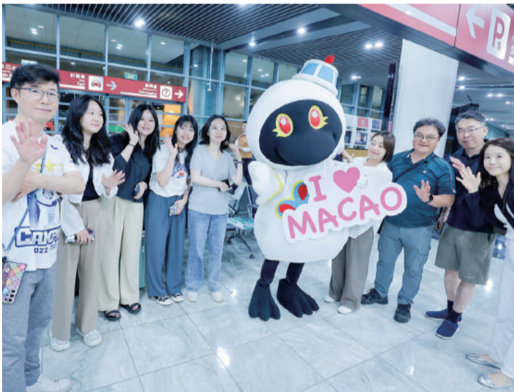
This photo provided yesterday and taken on Monday at midnight by the Macau Government Tourism Office shows the South Korean Delegation posing with tourism mascot MAK MAK at the local airport in Taipa.