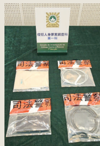
Evidence such as a USB cable and a mobile phone is displayed at the Judiciary Police (PJ) press conference room yesterday.