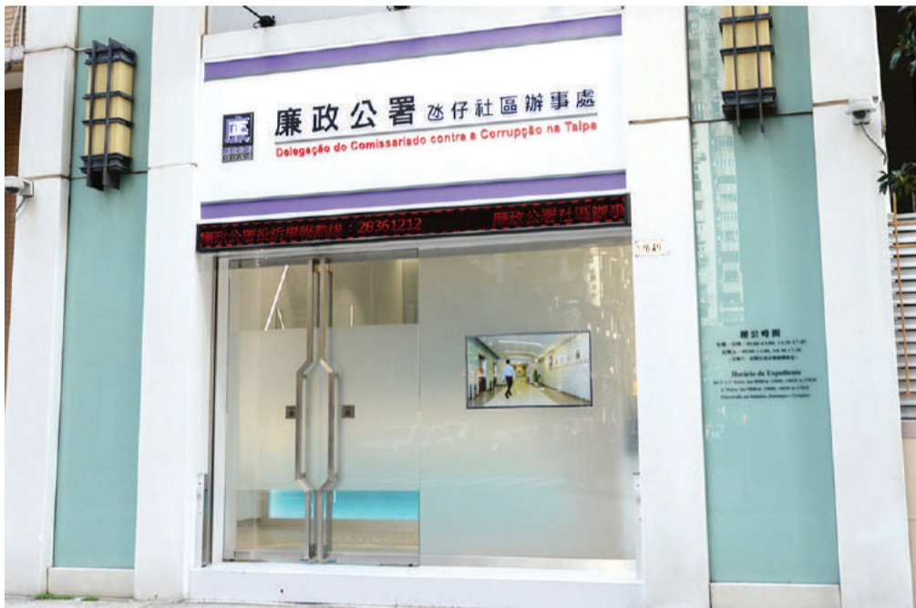
This undated handout photo taken from the Commission Against Corruption's (CCAC) website shows its branch office in Taipa, located on the ground floor of Block 4 of the Nova City residential estate.

According to the statement, the senior staff member used his power to help at least