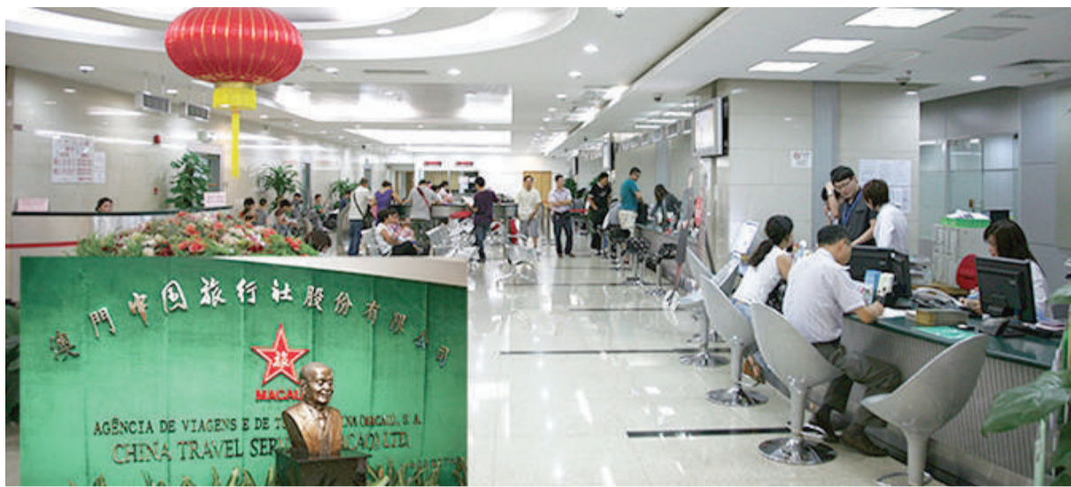
This undated file photo taken from the Nam Kwong (Group) Company Limited's website last night shows the facilities of China Travel Service (Macao) Limited in Nam Kwong Building on Avenida do Dr Rodrigo Rodrigues in Zape.

The NIA has released its "Guidelines for Application for Mainland Travel Permit for Hong Kong and Macao Residents (Non-Chinese Citizens)" on its official website, stating that applicants in Macau shall present and submit the originals and copies of the application form "filled in completely and accurately", with the applicant's recent ID photo pasted on it, as well