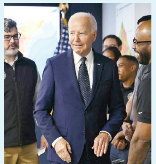
US President Joe Biden (centre) looks on during a visit to the DC Emergency Operations Centre in Washington, DC, yesterday.

ABC News said yesterday that President Joe Biden will sit down with the network on Friday for his first television interview since his election debate against Donald Trump raised questions over his fitness for office.