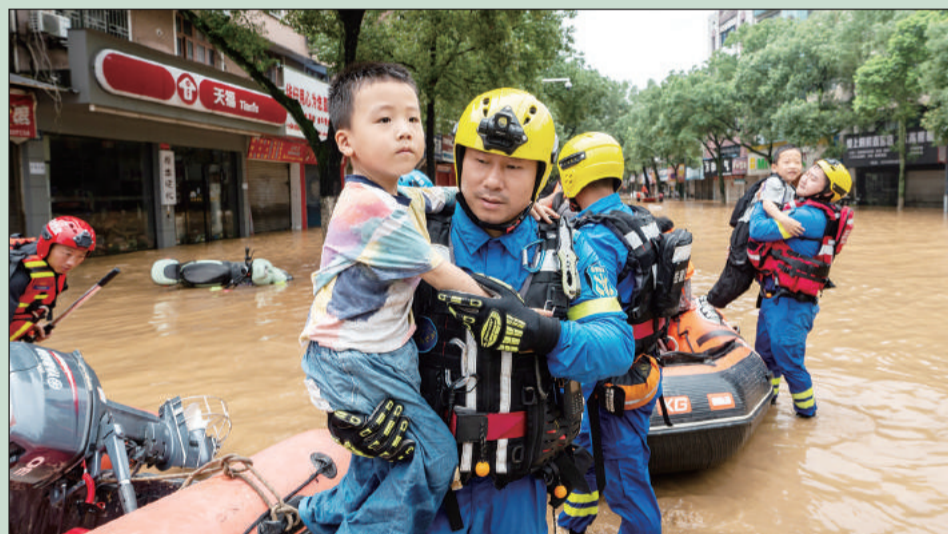
Rescuers transfer stranded residents in Pingjiang county, Hunan province, yesterday. Floods in Pingjiang are gradually declining. As of 6 p.m. yesterday, the water level of the Pingjiang watch station of the Miluo River was 76.18 meters, still 5.68 meters above the warning mark, but 1.49 meters lower than the peak level. —Xinhua

The industrial humanoid robot Walker S has already been deployed for on-site training at a factory of Chinese electric carmaker NIO and Dongfeng Liuzhou's motor assembly workshop. —Xinhua