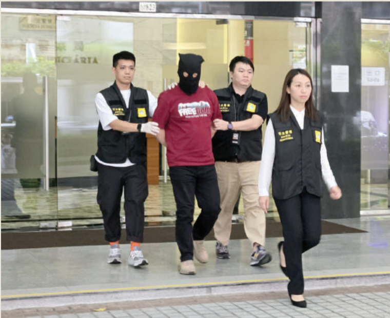
Judiciary Police (PJ) officers escort the hooded domestic abuse suspect to a police vehicle outside the PJ headquarters in Zape yesterday.

The suspect was transferred to the Public Prosecutions Office (MP) yesterday, facing domestic abuse and illegal recording charges. ■